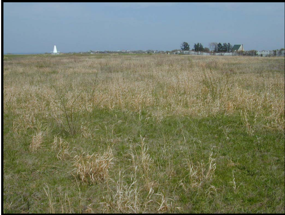
Photograph 7 Managed Grassland (infrequently mowed)