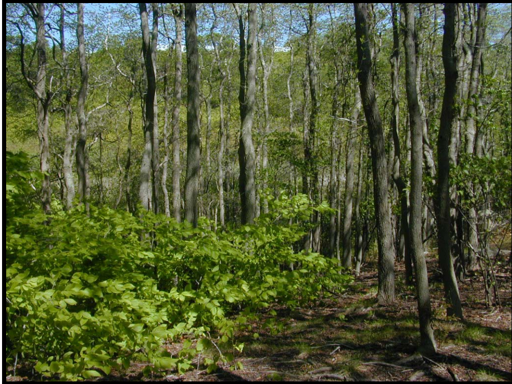
Photograph 3 Forest (American beech and black gum)