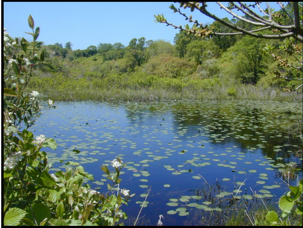
Photograph 1 Wetland Habitats (shallow open water, shrub swamp, and marsh)