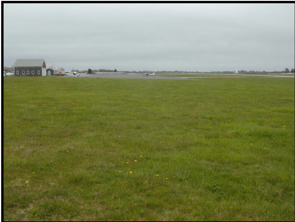
Photograph 8 Managed Grassland (frequently mowed) and Developed Land