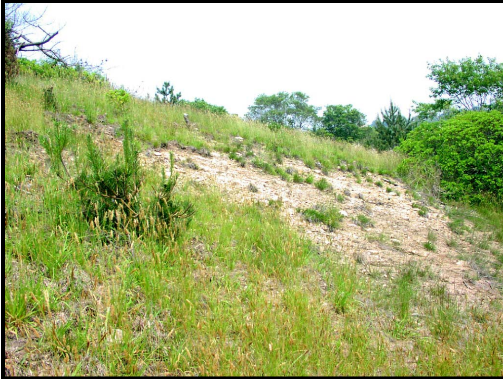
Photograph 5 Morainal Grassland