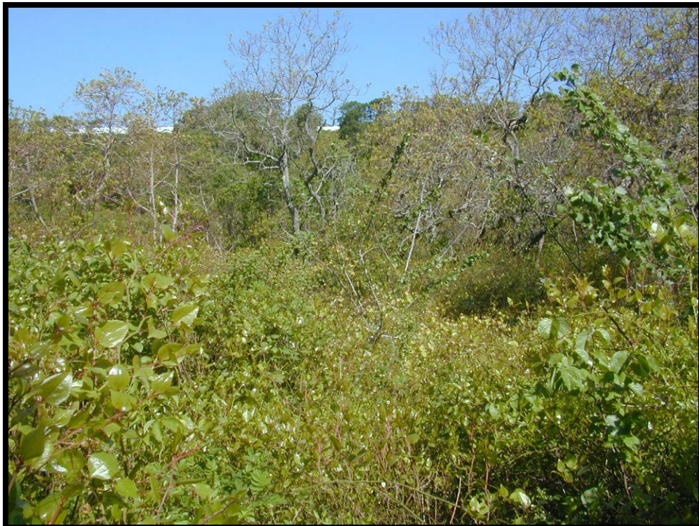
Photograph 4 Typical Maritime Shrubland