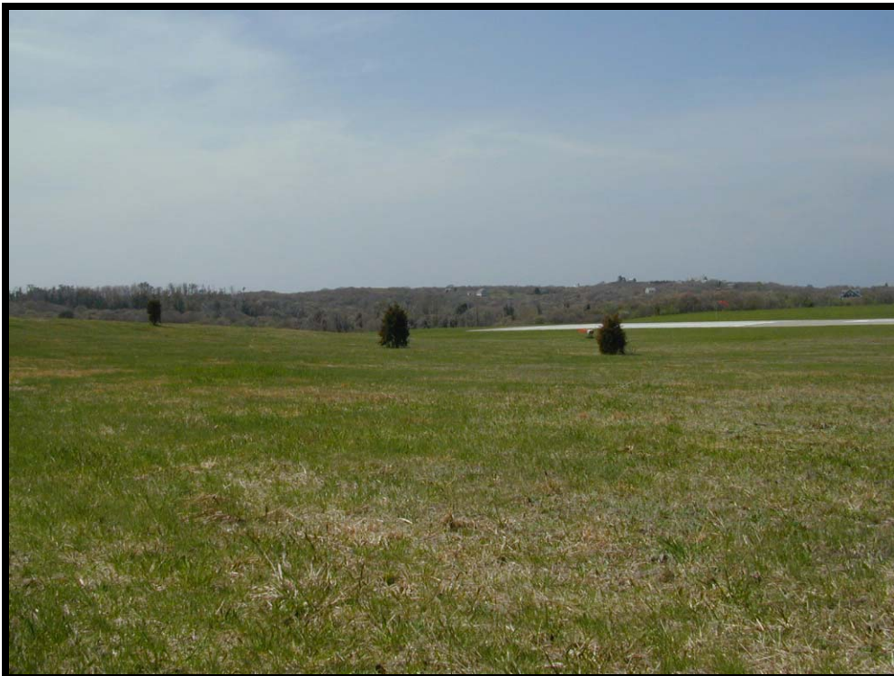
Photograph 6 Managed Grassland (annually mowed)